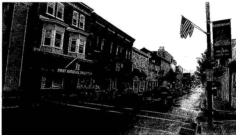
First Street as it currently appears. While property owners had attempted to improve their facades, they need more help to push it over the top.